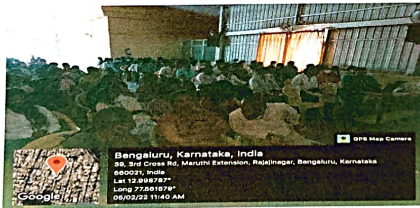
Students involved in training