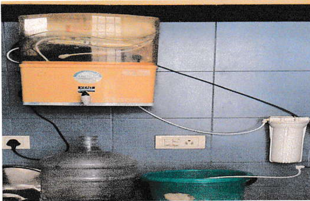
Photo of water purifier Installed in the campus for drinking purpose and reuse of waste water for other purpose.

Photos of Rain water harvesting and recharge of Bore well