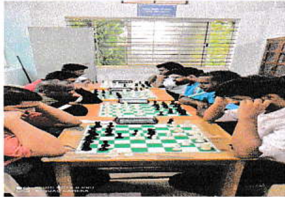
Chess Tournament hosted by our Institution in the year 2017-18