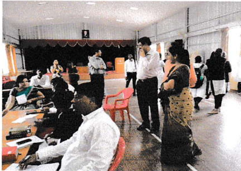
Client Counselling and Simulation Exercises